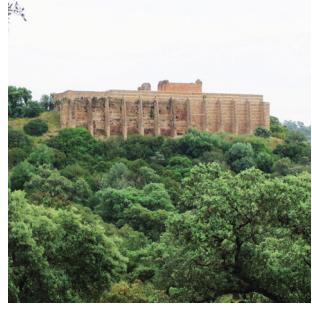
← Western wall with buttresses on which the terrace sanctuary is raised. ← Access stairs to the Podium Temple. ◆ Detail of the apodyterium wall paintings of the thermal baths.

Agencia Andaluza de Instituciones Culturales CONSEJERÍA DE CULTURA Y PATRIMONIO HISTÓRICO