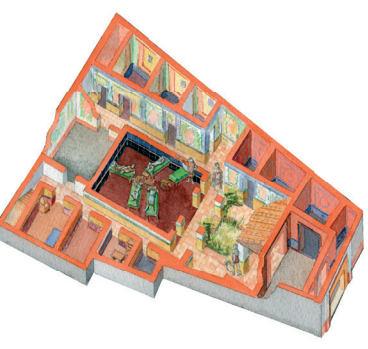
↑ Idealised reconstruction of one of the Munigua houses.

To date there are seven houses excavated in Munigua. They were different sizes -house 1 has a surface area of 500 square metres and came to have 22 rooms- its floors were adapted to the existing urban planning and underwent different renovations throughout its existence. All of them would have an upper floor, such as house 2-next to the Forum- used the ground floor to carry out business operations. There are houses have, still, walls remaining that are 2 metres high. In one of the rooms in house 5, a treasure of 122 coins was discovered, almost all of them from the second half of the 4th century.