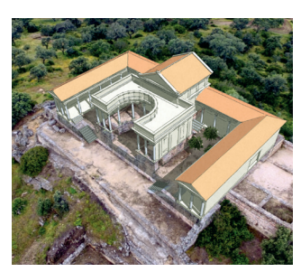
↑ Idealised reconstruction of the terrace Sanctuary.

The construction of some of its sections has been dated in the 2nd century A.D. It's construction affected the two necropoles of Munigua. As a completely unusual fact about the Roman world, some of the tombs were included in the interior of the pomerium, which would be a violation of Roman laws since it was totally forbidden to bury within the city. The wall did not meet defensive functions for which it was designed and raised because, for reasons unknown until now, the north side was never built.