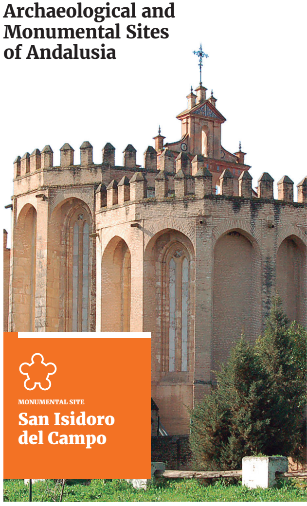
↑ View of the Monastery from the apses of the twin churches