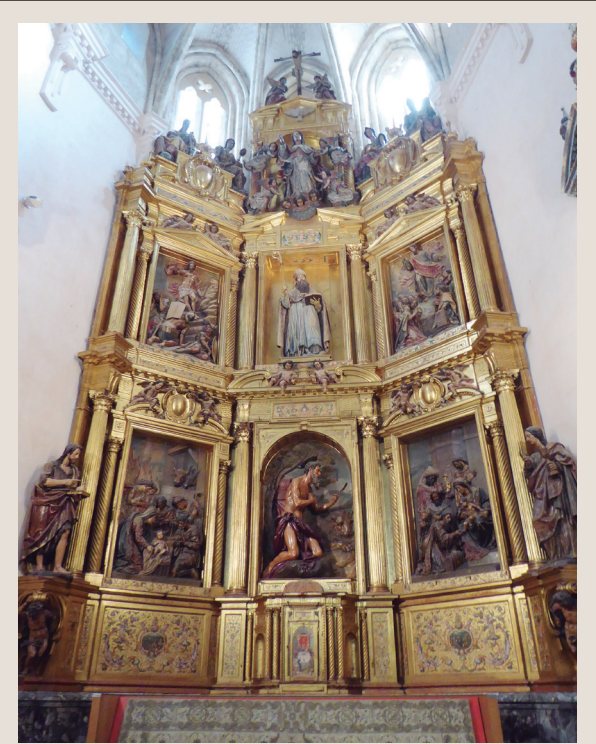
↑ Altarpiece by Martínez Montañés in the first church.

Agencia Andaluza de Instituciones Culturales CONSEJERÍA DE CULTURA Y PATRIMONIO HISTÓRICO