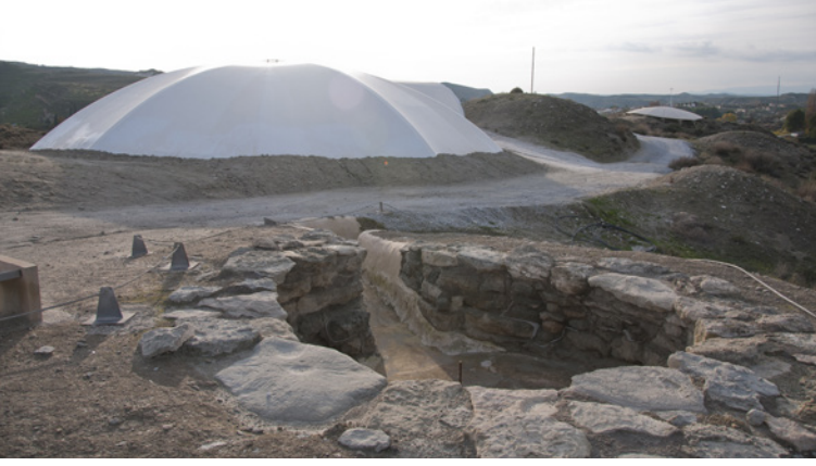
Tomb 21 in the foreground and tomb 20 cover at the bottom