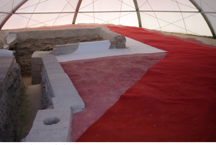
Tomb 20 musealised

In the second phase, the chamber is filled with stones and the rock cut to form an oval platform painted red. At the centre of this platform, as protection for the underground structures, a quadrangular space is constructed with an entry corridor. This open air building is framed within the platform by the form of the Cypriot ingot painted white.