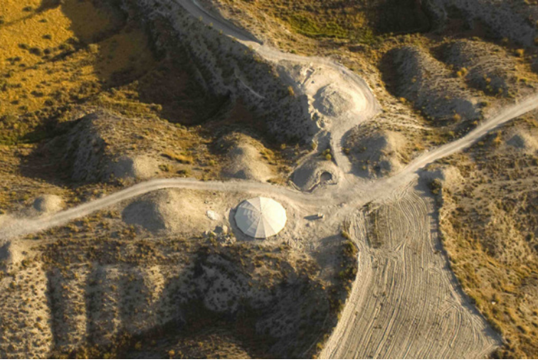
Aerial view of the sub-area Ia

Located in the vicinity of the urban centre of Galera, this necropolis, which dates back to the 5th century B.C., represents one of the most extensive and important displays of Iberian Culture at a national level.